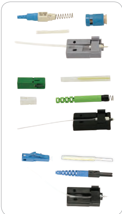
FUSEConnect Kits—ST (blue), SC (green), LC (blue)