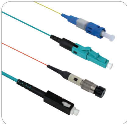
FUSEConnect Connectors (SC, FC, LC, ST)